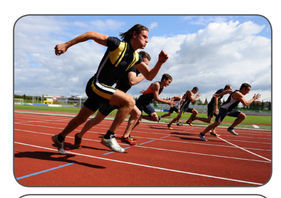
When you run, your body needs to produce a lot of energy.

To produce the energy our bodies need for running, we take in oxygen through the respiratory system. The respiratory system is a system of the body that takes in oxygen and releases carbon dioxide. Intense activities like sprinting require the respiratory system to work